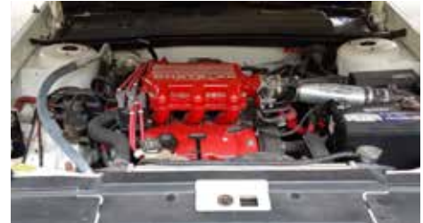
Selling late husband's car – 1993 DODGE DAYTONA IROC: 3 litre 6 valve, 5speed manual transmission. Car is located in Tualatin. To make arrangements to inspect and make an offer, email info@cascadepacificplymouth.org with your phone number and we'll put you in touch. Seller wants to see your offer.